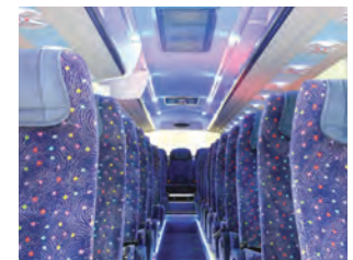
Fasten ceiling panels to interior for future access.