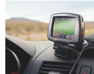
Anchor vehicle accessories to dashboard.