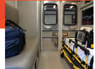
Attach cushioning panels in an ambulance or bus.