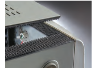
Attach access panels to industrial, electronic and electrical equipment.