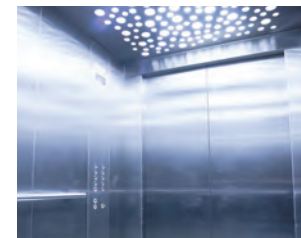
Attach elevator control panel to interior wall.