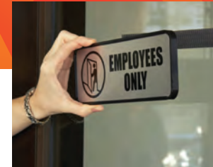
Secure plastic signs to window glass.

3M, Dual Lock and VHB are trademarks of 3M Company. Used under license in Canada. Please recycle. Printed in USA. © 3M 2017. All rights reserved. 70-0709-4083-1 (Rev 3/2017)